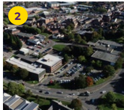
SWADLINCOTE TOWN CENTRE