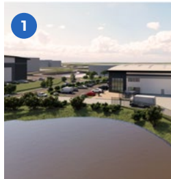
DOVE VALLEY PARK Foston