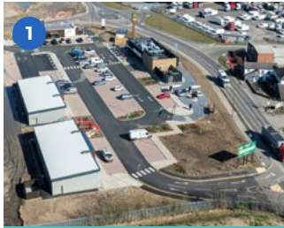
NEW STANTON PARK Ilkeston

Discover the opportunities for investment in Erewash - the ideal location for ambitious enterprises to establish, expand and succeed.