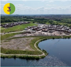
SHIPLEY LAKESIDE Heanor / Ilkeston

Asset class Industrial / distribution / mixed use Investment type Investor / occupier Site Strategic employment site; outline permission granted Project value £250m Project stage / timeline Buildings available from 2028 Size 30 hectares, 450k m 2 B2 / B8