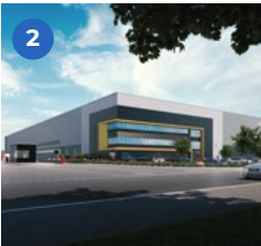
CINDERHILL A38 Denby, Derbyshire

Asset class Residential / commercial / leisure Investment type Investor / developer Site North Mill and East Mill part of Derwent Valley Mills World Heritage Site; residential; A1/A3-A4 commercial; B1 office space Project value Undisclosed Project stage / timeline Forecast completion 2029 Size 6,400m 2 commercial space;